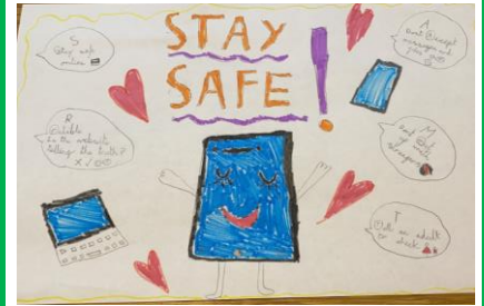
Year 2 created a poster telling others how to stay safe when using the internet.