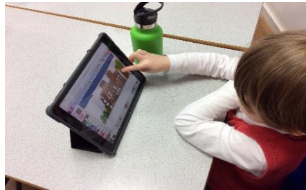
Year 1 using drawing and text tools to create engaging e-books.