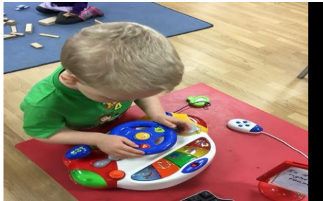
EYFS exploring technology toys. They were able to press parts to make them work.