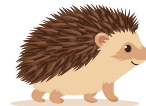
I'm a Little Hedgehog