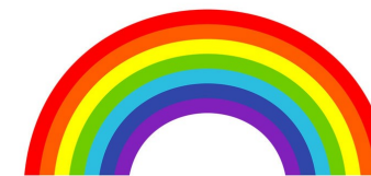
I Can Sing a Rainbow