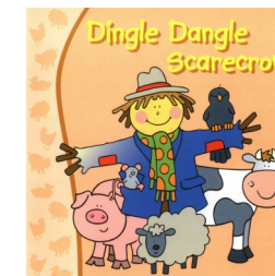
Dingle Dangle Scarecrow