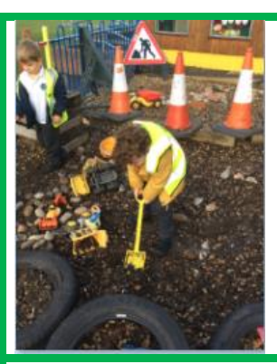
Outdoor construction area – supporting younger children to develop their fine and gross motor skills