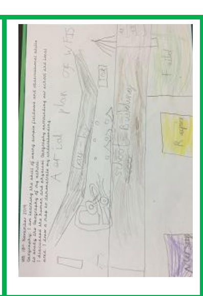
A Year 2 pupil's aerial view of Wallace Fields Infant School.